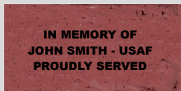
Ex: 4" x 8" Brick—3 Lines of Text